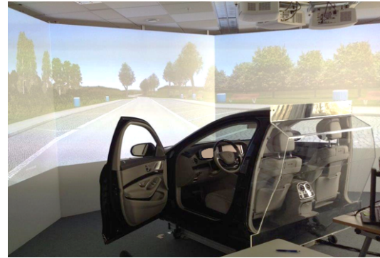
Figure 1: The setup of the driving simulator.

To automatically assign emotions to textual units, the application of dictionaries has been a popular approach and still is, particularly in domains without annotated corpora. Another approach to overcome the lack of huge amounts of annotated training data in a particular domain or for a specific topic is to exploit distant supervision: use the signal of occurrences of emoticons or specific hashtags or words to automatically label the data. This is sometimes referred to as self-labeling (Klinger et al., 2018; Pool and Nissim, 2016; Felbo et al., 2017; Wang et al., 2012).